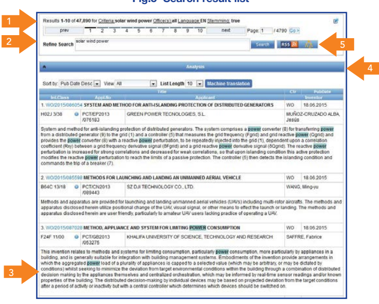
Fig.5 Search result list