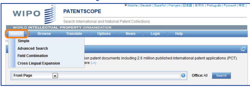
Fig. 3 Search interface

The PATENTSCOPE search service offers the user four possible levels of search. These can be chosen from the "Search" dropdown menu indicated below: