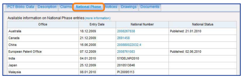
Fig. 8 National status information regarding a specific international patent application

Regional and international patent application files may contain "national phase entry" data, which is accessed by clicking the "National Phase" tab. This is important information which shows the countries where the applicant is seeking patent protection and gives the patent reference number from which it is possible to investigate whether the patent has been granted.